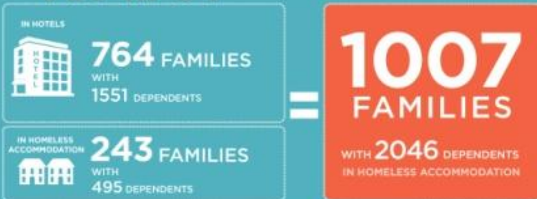
Number of adults with dependent children who are homeless in Dublin December 2016 - January 2017